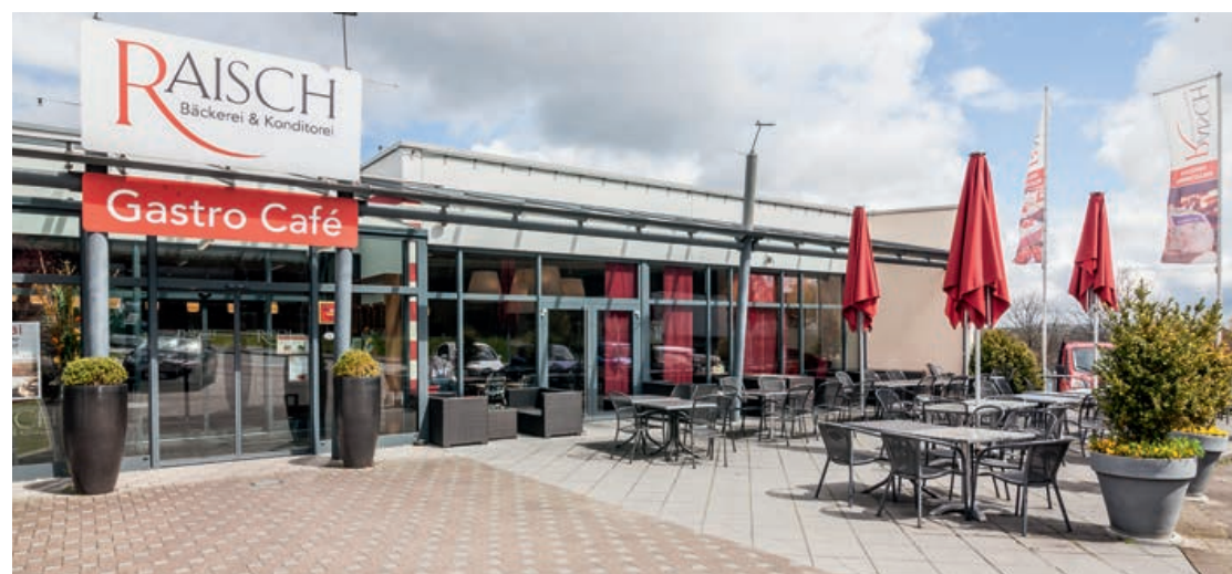
The main bakery in Calw-Oberriedt is perfectly positioned in the nature park situated in the northern and central Black Forest.