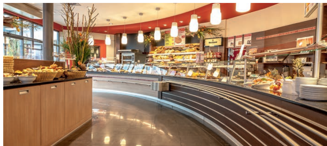
A spacious layout and an impressive range of products await customers at the main Raisch bakery.