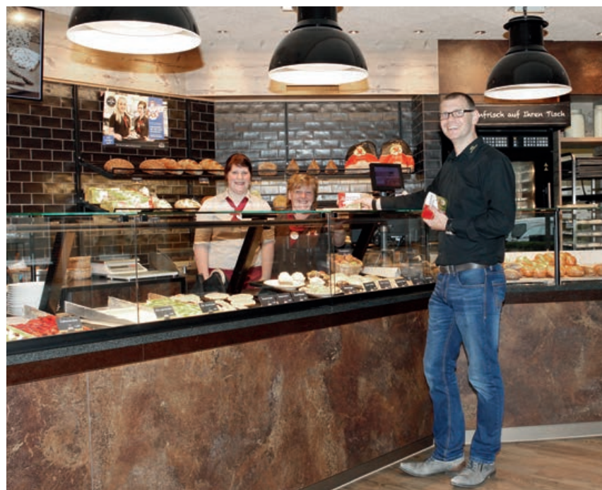
Virtually all the Wikingerbäcker shops offer a café style environment with food to eat in or takeaway.

used up all the flour, we stop making that particular bread until the next harvest,“ says Stein, explaining how rigorously they follow their philosophy. „We're not a factory and we don't intend to become one.“