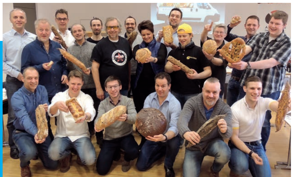
Qualified bread sommeliers fresh from the National Bakers' Academy are consummate experts in the world of food pairings.