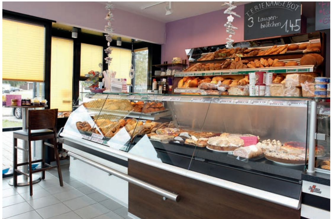
Customers love the fantastic range of products offered by the „Knusperbäcker Gamm“ bakery.

returning from a night shift, enabling people to buy the bakery’s outstandingly crispy baked goods „on the go“, without even having to get out of the car. „The key to our success isn’t just the quality of our goods, but also our location,“ says Gamm. „Being right next to an industrial estate and on a