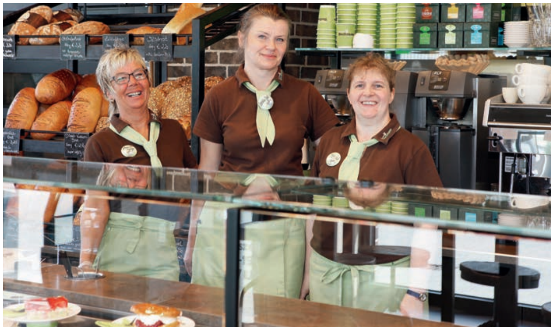
As well as traditional bakery and confectionery products, the Beckmann bakery also offers a range of culinary delights that are very popular with customers.

He keeps the company's flag flying by running regular marketing activities with local institutions, for example baking special loaves for firefighter events (bread with fresh bell peppers), a „church loaf“ for confirmations,