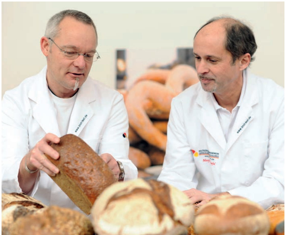
Quality inspectors from the Institute for the Quality Assurance of Baked Goods evaluate the appearance and consistency of baked goods as well as their taste.

As well as raising the flag on an international level, the Bakers' Academy also puts wind in the sails of German baking on a national scale by showcasing and driving forward the craft of baking. The Institute for the Quality Assurance of Baked Goods (IQBack e.V.), which forms part of the Bakers' Academy, provides support on all aspects of efficient quality assurance in the breadmaking business. Backed by IQBack, bakers can request authorised inspection bodies to examine and certify