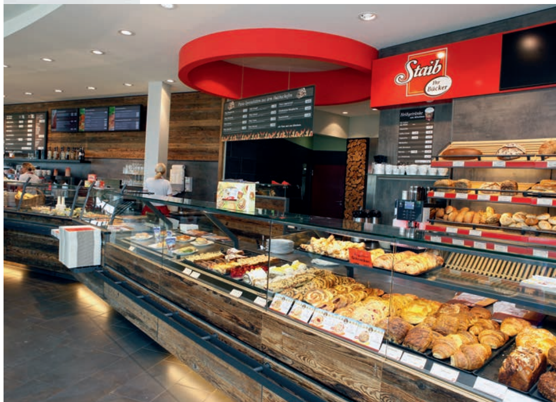
A wide selection of top-quality products ensures excellent sales of baked goods and lunches.

The Ulm bakehouse is staffed by a daily contingent of 26 bakers and 27 confectioners. They keep Staib’s artisan baking traditions alive, producing most of the company’s high-quality products by hand. Their hearty creations are based on poolish (pre-ferment) made in-house, as well as wheat, rye and spelt sourdoughs.