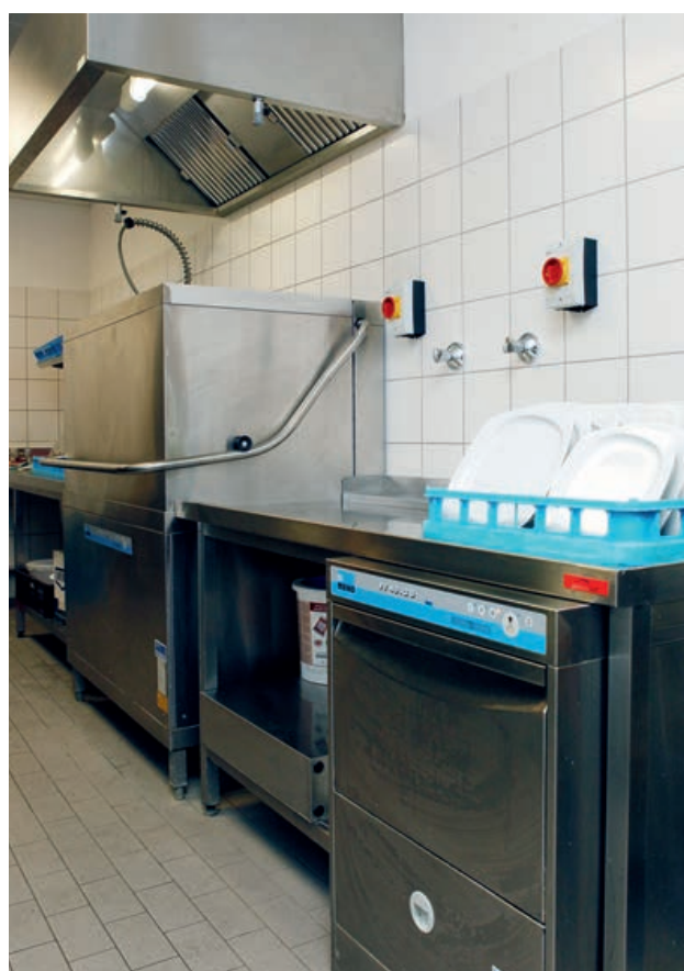
MEIKO warewashing machines can handle heavy use over many years