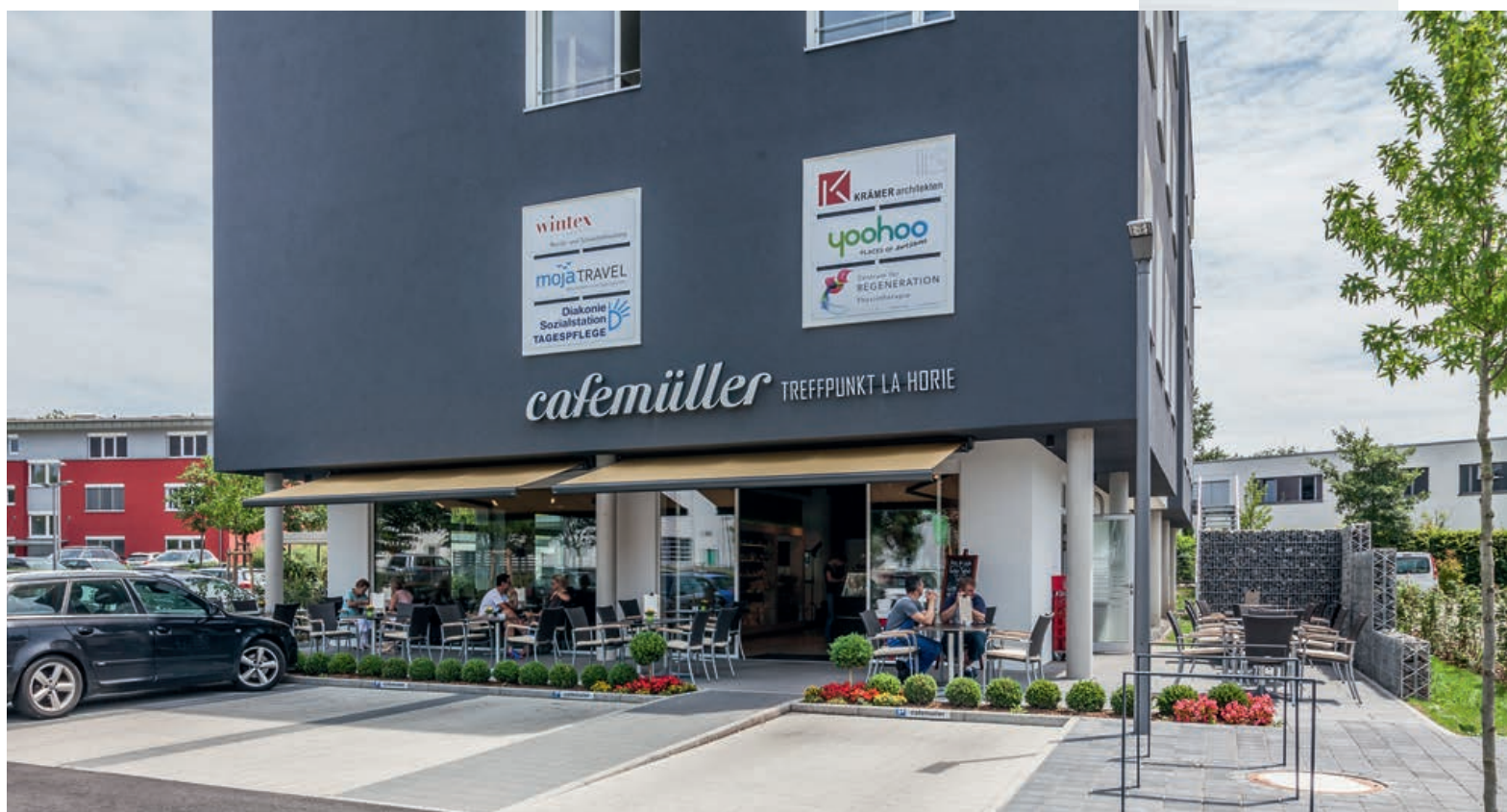
Surrounded by law firms, a bank and a supermarket, the „cafemüller – Treffpunkt La Horie” has been a resounding success since it opened.