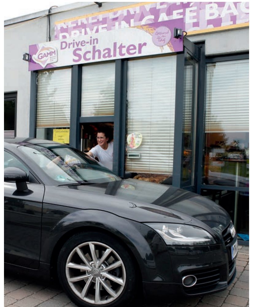
Next turn for the bakery – the Gamm drive-in counter is the perfect choice for people on a tight schedule in the morning.

of his turnover. „Our fan base for those products is constantly growing!“ says Gamm, though he emphasises that they still favour a two-pronged strategy. Bioland-certified products are more expensive than conventional baked goods, so anyone who can’t or doesn’t want to pay the higher